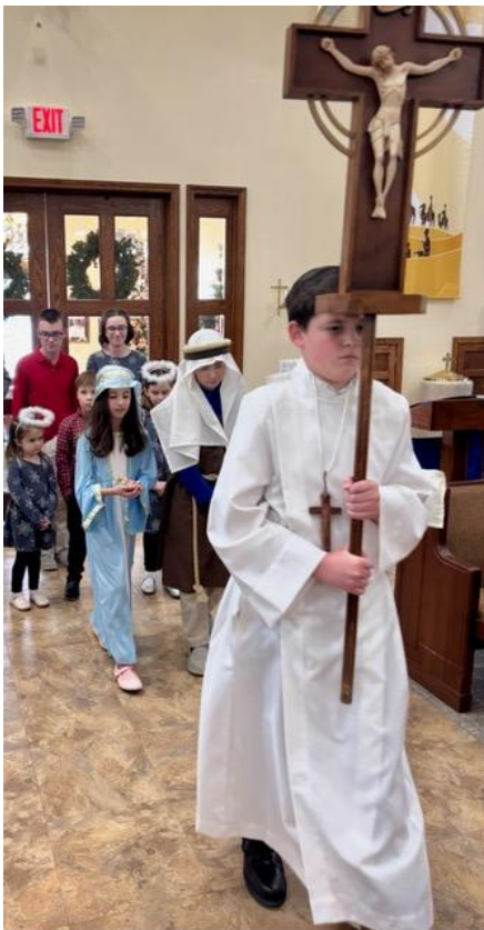
Christmas Eve and Christmas Day Mass was led by the children of Good Shepherd church portraying the Holy Family.